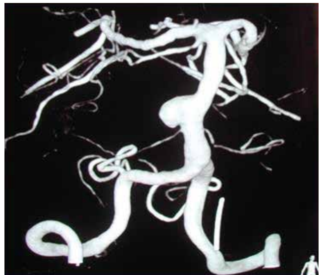
Figure 1. Basilar artery Aneurysm