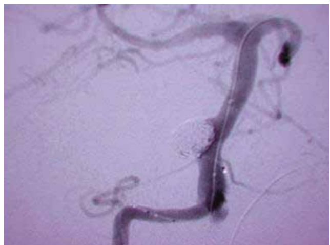
Figure 3. Post procedure angiogram showing complete exclusion of the aneurysm.