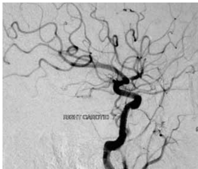
Fig 4: Six-Month follow-up angiography showing complete obliteration of the right CCF.

He was instructed to switch to a single antiplatelet agent. At Six months follow-up, angiography showed complete occlusion of the CCF. Neuroendovascular therapy in a country like Pakistan with fragile economy brings additional challenges such as a scarcity of neuro-interventional disposables due to problems with the import of these expensive materials and the necessity to succeed in completely embolizing a given CCF, aneurysm etc. to justify the costs involved. Training of specialists remains a difficult task due to the scarcity of both materials and physician tendency to start self-learning these high risk procedures without professional oversight. In conclusion, our initial experience of using a covered stent to treat CCF in Pakistan indicates procedural feasibility, increased occlusion and anatomic cure rates, elimination of the mass effect and reduced cost of treating such fistulas without compromising the parent vessel. Long term clinical follow-up studies are needed.