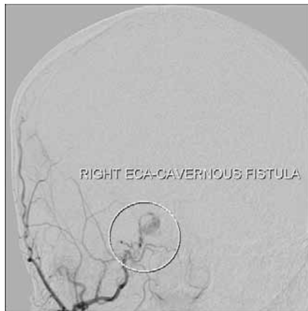
Fig 2: Selective Right ECA Angiography [Anteroposterior view] showing an arterial feeder to the Right CCF.