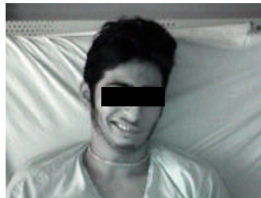
Figure 1: Left facial nerve palsy

On examination at the time of admission, he was opening eyes on painful stimuli, localizing with the right hand, and had no verbal response. Power was 0/5 in the left half of the body with extensor plantar response on the left. He had a left facial nerve palsy of upper motor neuron type.