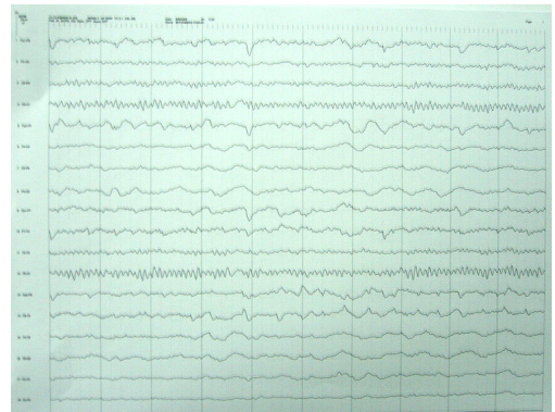
Figure 4: EEG showing right hemispheric dysfunction

creatinine, electrolytes, and random sugar were within normal limits. Anti-epileptic drug levels were in the sub-therapeutic range. Magnetic resonance imaging of the brain (including diffusion-weighted studies) was normal.