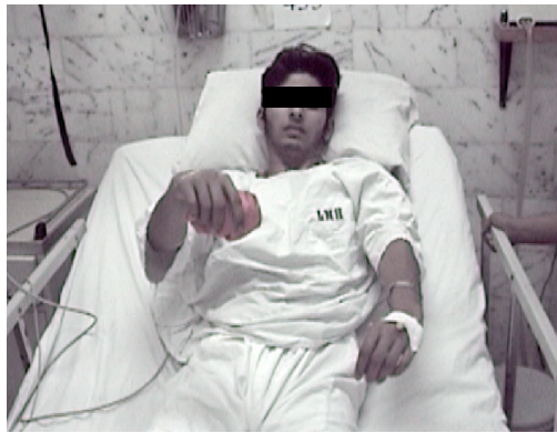
Figure 2: Left-sided hemiparesis